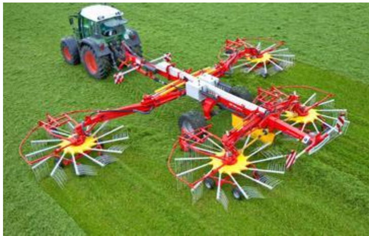
Figure 1: A typical agricultural machine of Poettinger: a centre-swath rake with four rotors 3

Poettinger is highly aware of its responsibility towards the environment and future generations. Therefore sustainability plays a very important role and all issues concerning environmental, economic and social issues are taken very seriously. This applies especially when it comes to developing and improving agricultural technology and new distribution strategies. Poettinger puts three values proudly on its banners: Innovation, dedication and authenticity. 2