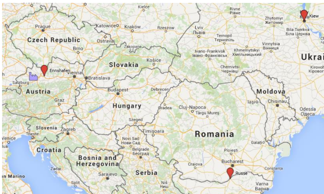
Figure 2: Geographical map with relevant places. 5

"Yes, that is true", continued Franziska, "The thing is, by now, we supply all of our Ukrainian customers via our subsidiary in Boryspil, which is close to Kiev. But there are several problems that we have to face, as we currently transport all of our machines by truck. Due to their size, some of our machines require special equipment like flat-bed trailers, so transport costs are very high. Not just because of the equipment itself, but also because the capacity of the trucks is limited. Additionally there is little to no cargo that the drivers can take with them on their way back. Therefore the forwarding agencies charge us more than just the distance that they transport our cargo in order to cover the costs that they have when they drive back with empty trailers. It is a matter of money on one side, but also highly inefficient and unsustainable on the other side. A lot of carbon-dioxide is being produced unnecessarily, just because trucks need to drive back without cargo. And trucks simply produce a lot more pollution than the other modes of transport. Wait a second, I'll show you something!" Franziska turned towards her laptop. She typed something on the keyboard that Thomas was not able to capture, and clicked several times with the computer mouse.